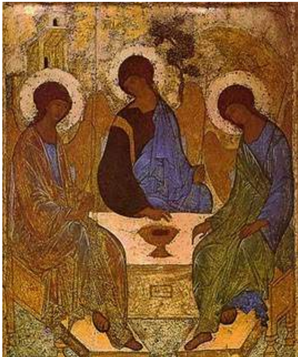
Image: Andrei Rublev, public domain scan