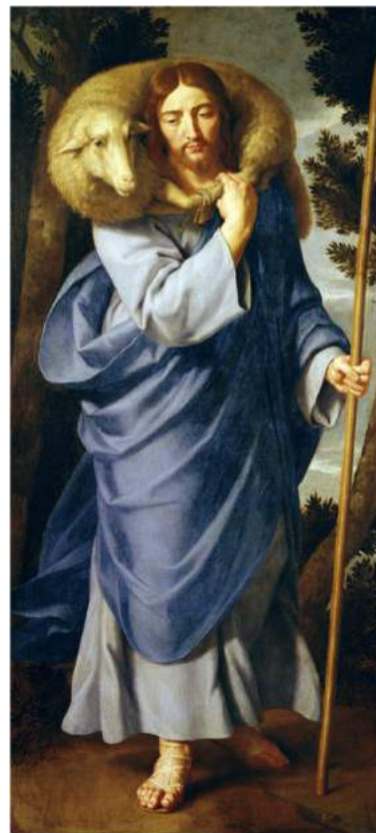
Good Shepherd by Jean-Baptiste de Champaigne

All the tax-collectors and sinners were coming near to listen to him. 2 And the Pharisees and the scribes were grumbling and saying, 'This fellow welcomes sinners and eats with them.' 3 So he told them this parable: 4 'Which one of you, having a hundred sheep and losing one of them, does not leave the ninety-nine in the wilderness and go after the one that is lost until he finds it? 5 When he has found it, he lays it on his shoulders and rejoices. 6 And when he comes home, he calls together his friends and neighbours, saying to them, "Rejoice with me, for I have found my sheep that was lost." 7 Just so, I tell you, there will be more joy in heaven over one sinner who repents than over ninety-nine righteous people who need no repentance. 8 'Or what woman having ten silver coins, if she loses one of them, does not light a lamp, sweep the house, and search carefully until she finds it? 9 When she has found it, she calls together her friends and neighbours, saying, "Rejoice with me, for I have found the coin that I had lost." 10 Just so, I tell you, there is joy in the presence of the angels of God over one sinner who repents.'