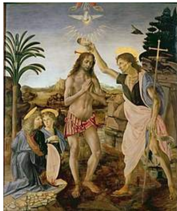
Baptism of Christ by Verrocchio, 1472

Jesus came from Galilee to John at the Jordan, to be baptized by him. 14 John would have prevented him, saying, 'I need to be baptized by you, and do you come to me?' 15 But Jesus answered him, 'Let it be so now; for it is proper for us in this way to fulfil all righteousness.' Then he consented. 16 And when Jesus had been baptized, just as he came up from the water, suddenly the heavens were opened to him and he saw the Spirit of God descending like a dove and alighting on him. 17 And a voice from heaven said, 'This is my Son, the Beloved, with whom I am well pleased.'