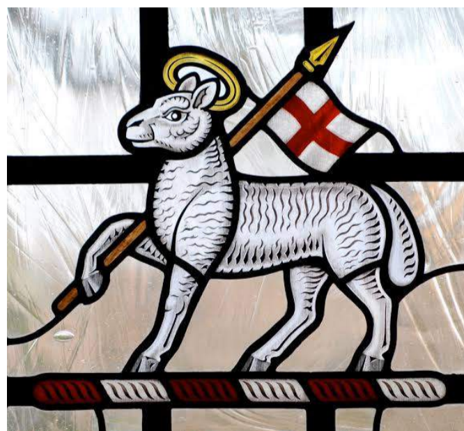
Guildford Cathedral Stained Glass - Paschal Lamb Flag.

35 The next day John again was standing with two of his disciples, 36 and as he watched Jesus walk by, he exclaimed, 'Look, here is the Lamb of God!' 37 The two disciples heard him say this, and they followed Jesus. 38 When Jesus turned and saw them following, he said to them, 'What are you looking for?' They said to him, 'Rabbi' (which translated means Teacher), 'where are you staying?' 39 He said to them, 'Come and see.' They came and saw where he was staying, and they remained with him that day. It was about four o'clock in the afternoon. 40 One of the two who heard John speak and followed him was Andrew, Simon Peter's brother. 41 He first found his brother Simon and said to him, 'We have found the Messiah' (which is translated Anointed). 42 He brought Simon to Jesus, who looked at him and said, 'You are Simon son of John. You are to be called Cephas' (which is translated Peter).